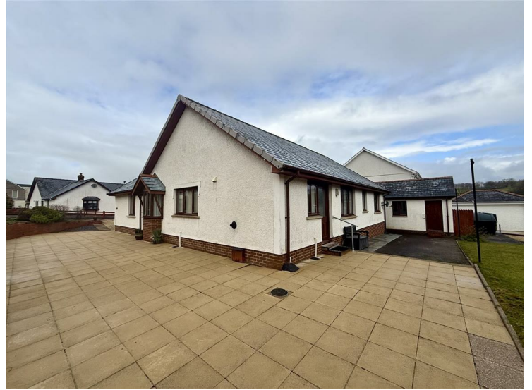
One of the main features of this property are the good sized grounds yet being easy to maintain with lawned areas and extensive paved and gravelled patio areas