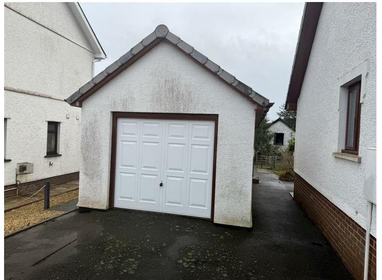
Detached garage with front up and over door and rear courtesy door.