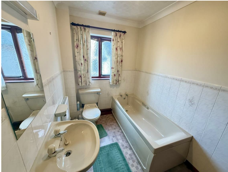
with bath wash basin, toilet, bidet and half tiled walls.